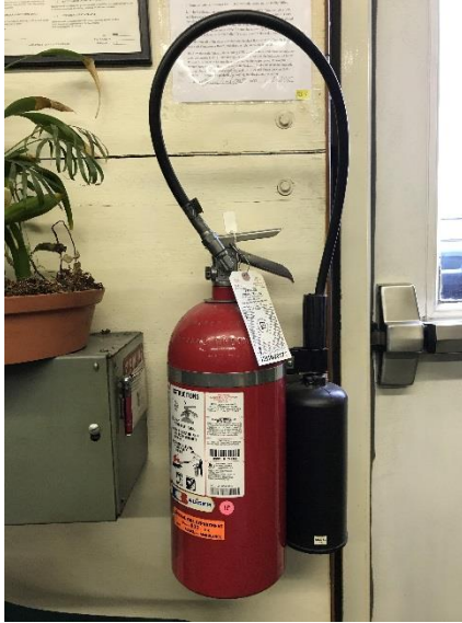
CO2 Fire Extinguisher