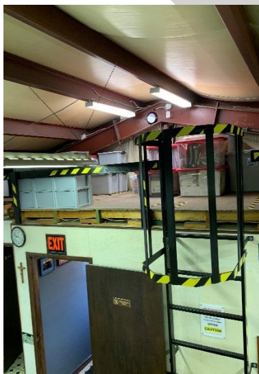
Birdseye View of the Mezzanine

The Mezzanine Project which was started a few months ago is rolling along nicely. All of the old boxes, and a lot of junk was removed from the Mezzanine, and it is now organized really well. An access platform was constructed to be able to reach the Hot Water Tank which is located above the Restrooms, and a Light was also added near the Tank for use if any problems occur with the Tank. A safety cage was designed and installed at the top of the access ladder as well. So this has been a great project, and has opened up a lot of useable space in the Shop.