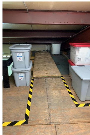
Access Platform to Hot Water Tank